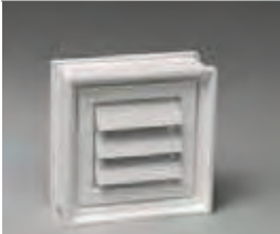
Dryer Vent - Outside View