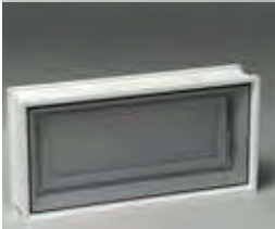
Fresh Air Vent - Outside View