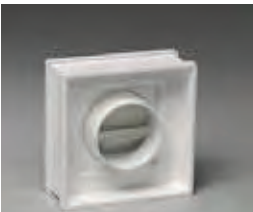
Dryer Vent - Inside View